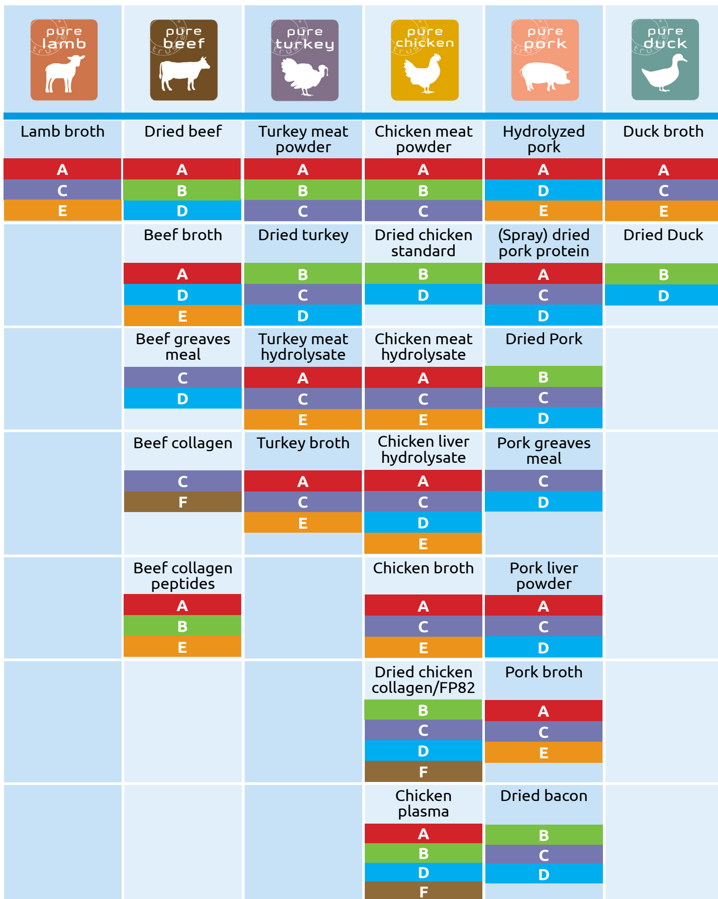
Table 2: IQI available animal protein powders with final product characteristics